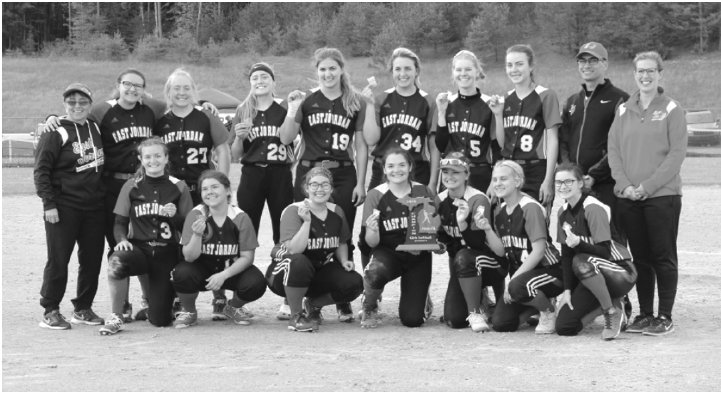
The East Jordan softball team pose with the championship trophy after winning their second straight Division 4 district title.