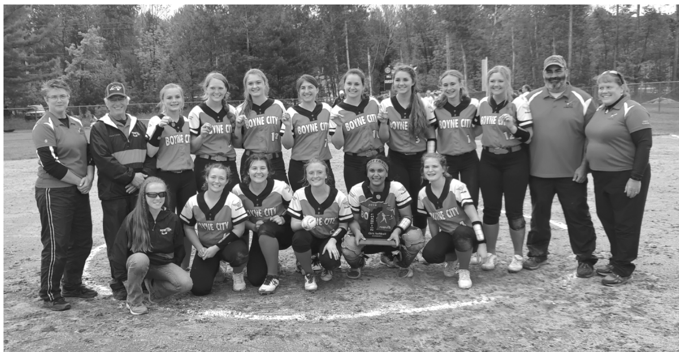
Boyne City poses with the Division 3 district trophy, their 7th in a row.