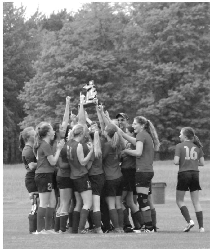
The Boyne City soccer team celebrates their first district title.