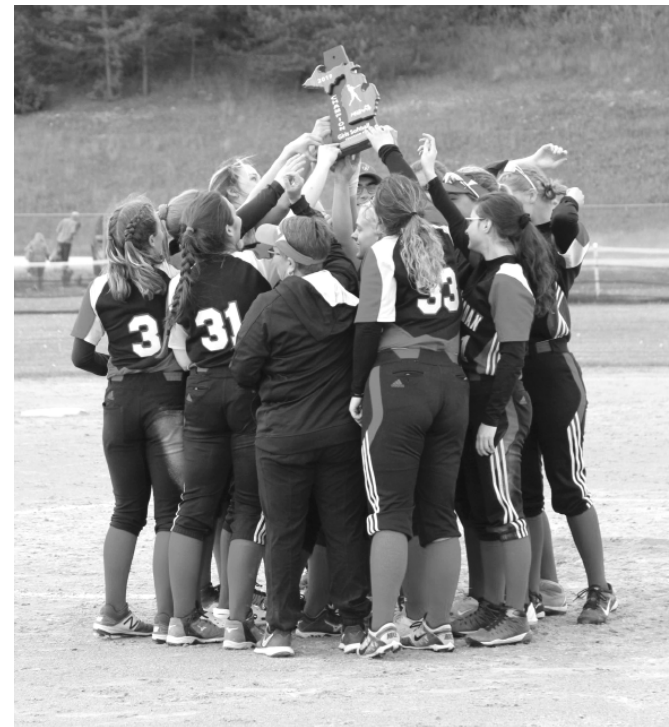
The Red Devils celebrate their back-to-back Division 4 district titles.